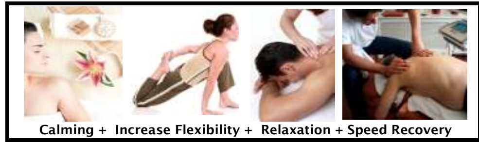
Calming + Increase Flexibility + Relaxation + Speed Recovery