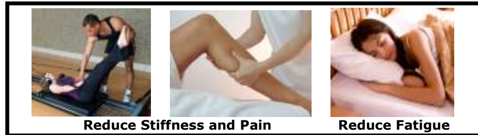
Reduce Stiffness and Pain