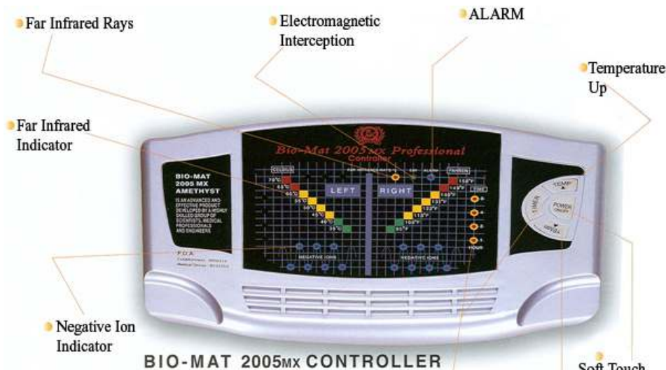
BIO-MAT 2005MX CONTROLLER

Soft Touch Power On/Off and Temperature Up/Down It has the most advanced I.C. Chip which cuts off Electromagnetic Waves A control system which has many convenient functions Temperature Up/Down: to set the temperature of the Bio-Mat. You will see the lights move up and down on the indicator as you press the buttons.